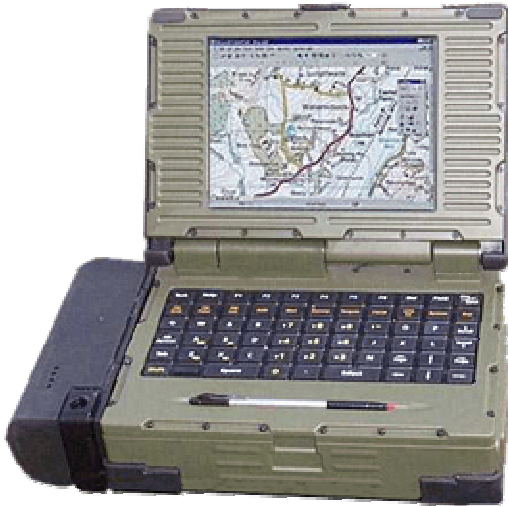
Termite LT450F showing rechargeable battery pack attached (left)