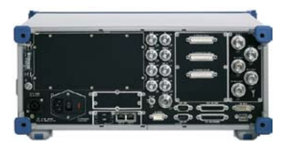
Rear view of the R&S®ESMD

Due to its compact design and many special functions, the R&S®ESMD is ideally suited for detecting all types of radio interference. Special functions such as an adjustable measurement time and continuous or periodic level output have been integrated for these tasks. Since these functions also work in the HF spectrum, it is easy to find even nonperiodic interferers which would otherwise be difficult to detect due to their irregular appearance in a quickly changing spectrum. As a result, the source of interference can be quickly detected and eliminated – an aspect that is extremely important in security-critical radio traffic (e.g. airborne communications, air traffic control, ATC).