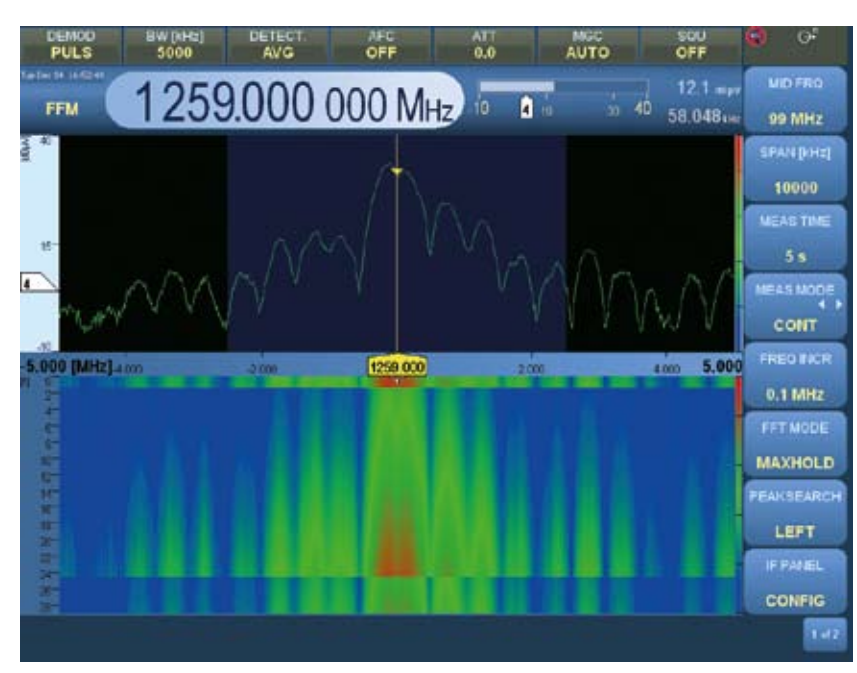
Detection and analysis of a radar pulse

To enable more in-depth analysis of the signal spectrum and signal environment, the receiver is equipped with an IF panorama. The current receive frequency is at the center of the spectrum display. The span can be set between 1 kHz and 20 MHz for optimal adaptation to the task at hand. MINHOLD, MAXHOLD and AVERAGE displays are also possible, allowing an even broader scope of applications.